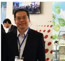
02 A global perspective