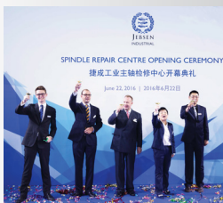
03 Jepsen Industrial launches Spindle Repair Centre in China