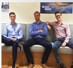
03 East meets West